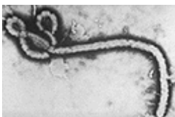
Ebola virus

Some are like skinny sticks while others look like bits of looped string. Some are more complex and shaped like little lunar landing pods.